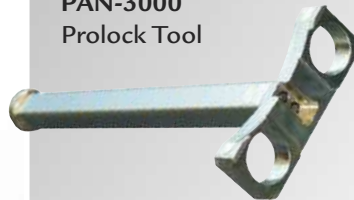
PAN-3000 Prolock Tool

Now imported solely by Parma Industries, Prolocks contribute to safety on British roads, following trials with major bus fleets.