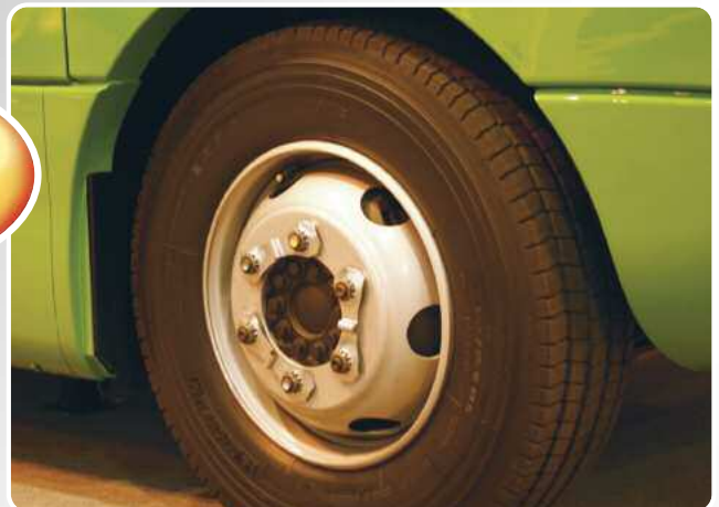
PAN-2725 Smaller size Prolock on 6-stud 17.5" wheels